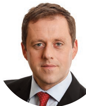
Minister of State Thomas Byrne TD

“Today’s announcement is about all of the innovative work that is underway to normalise the language in every field.”