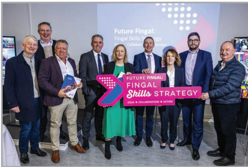
The Fingal Skills Strategy has strong support from a variety of key stakeholders.

With its strategic location, strong population growth, and diverse economic base, Fingal is a key driver of the Irish economy with a highly skilled and experienced workforce that supports both local and multinational companies.