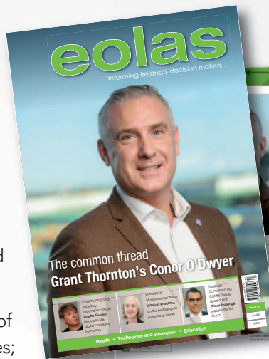
Front cover profile interview

In addition, eolas features comprehensive sector-specific reports on health, education, infrastructure, digital government, energy, environment and sustainability, housing, business, the economy, construction, public affairs, local government, transport, criminal justice, learning and skills, governance, and regional focus reporting.